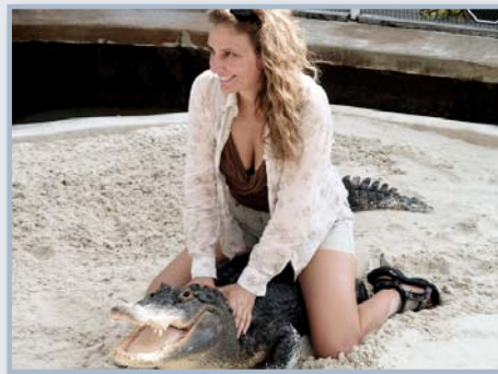
Thatcher with gator companion during filming of Alligator Princess

quest to search for the wilderness and singularity that still remains outside the "tame" boundaries of modern Florida. Thatcher is also the first person to paddle the entire river system by herself. At Equinox, we're very excited about its festival and market potential.