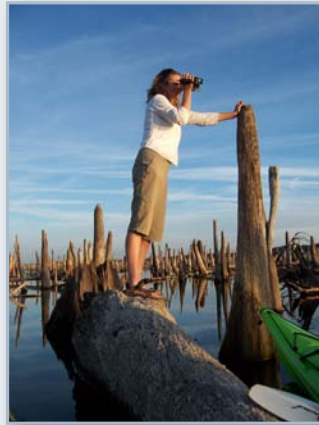
cypress remnants in Rodman Lake