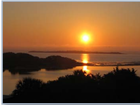
sunset at Cedar Key

— NuRF: The Nutrient Reduction Facility . It is now posted on their website and ours. We were also able to actually see the fruits of our