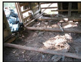
Rodent debris under cabin floor being removed.

Following the removal of these threats, builder Jeff Penuel successfully leveled and straightened the chimney. This was no small feat considering that the weak, sandy mortar holding the bricks together was crumbling, one corner was being up-lifted by