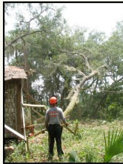
USFS sawyer John Bronson watches as large oak, whose roots were lifting the cabin chimney, falls safely away from the cabin.

were threatening the cabin. One live oak was actually directly impacting the cabin as its roots were lifting up the brick chimney and a second larger laurel oak was overhanging the cabin and near the end of its lifespan.