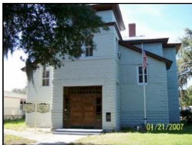
Umatilla Historical Museum

We have new hours for the Umatilla Historical Museum. The Museum will be open from 10 a.m. to 2 p.m. on the second Saturday of each month. It is also open other hours by request.