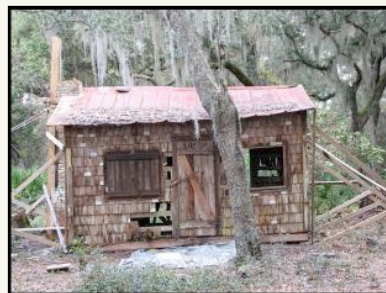
Cabin with straightened chimney .