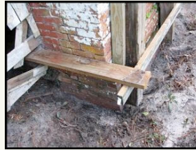
Chimney base directly on sand, no foundation!

rectly on a sand base...i.e., no foundation! ing stabilization/rebuilding of the deteriorated pole timber foundation and subfloor. In total, thirteen 42-gallon sacks of rodent-deposited organic material were removed, until bare soil was reached. Then the surface was decontaminated.