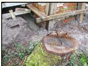
Root lifted chimney corner; leveled then stabilized with poured concrete foundation.

So, it was all hand work. There were a few tense moments, especially one morning, after a surprise heavy, overnight rain had created a washout, loosened bricks and buried the jack under sand. Jeff carefully removed the spoil, re-set the metal support plate between the jack and bricks and continued the nearly finished “righting” of the chimney. Just as