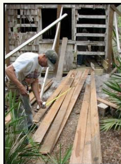
Inspecting and trimming rotten material from sound original floorboards.