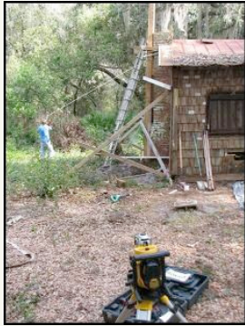
Jeff Penuel carefully adjusts the come-alongs.

A little here...a little there...stand back & look....listen...hold your breath...dog it off...let it rest over night...can't go too fast or risk the prospect of discovering just how