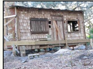
The “levitated” cabin, with foundation and subfloor removed!